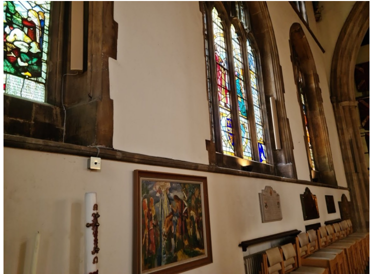
Floor plan North side, cable run on window sills from north porch to north transept