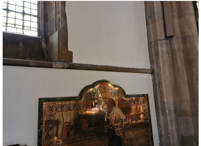
North side, site of 3rd booster