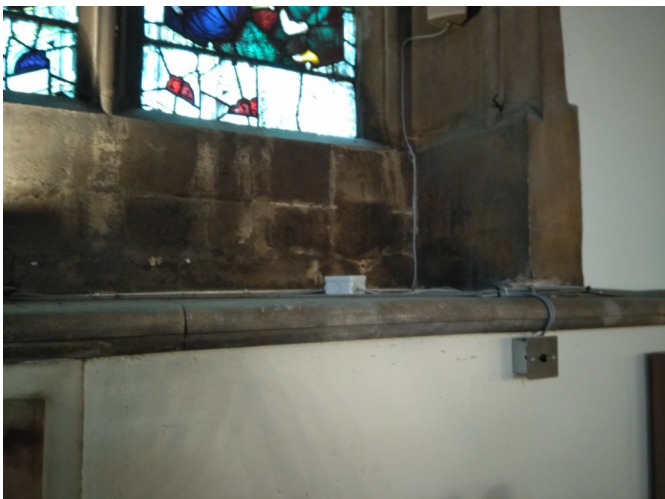
North side, site of 2nd booster