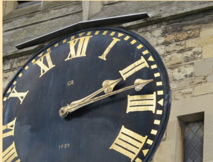
The Clock & Bells in urgent need of restoration